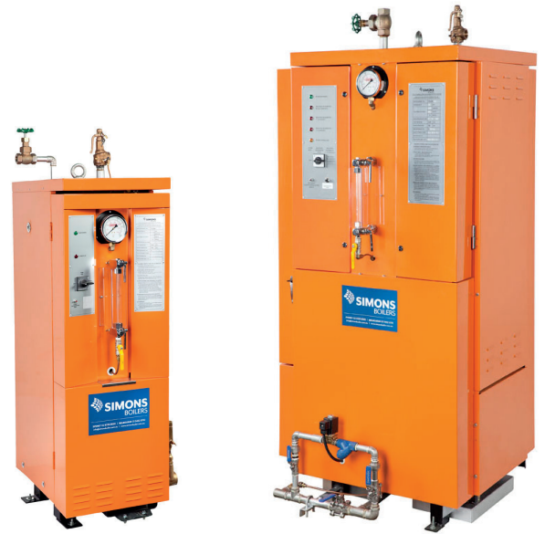
VS 300 SERIES 10 TO 80 KILOWATTS