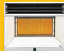
Available in Natural Gas

Input: 25MJ, 7.0 kW Width: 505mm Height: 359mm Depth: 419mm Weight: 10kg