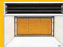
Available in Natural Gas & LPG

Input: 24MJ, 7.0kw Width: 505mm Height: 332mm Depth: 417mm Weight: 10kg