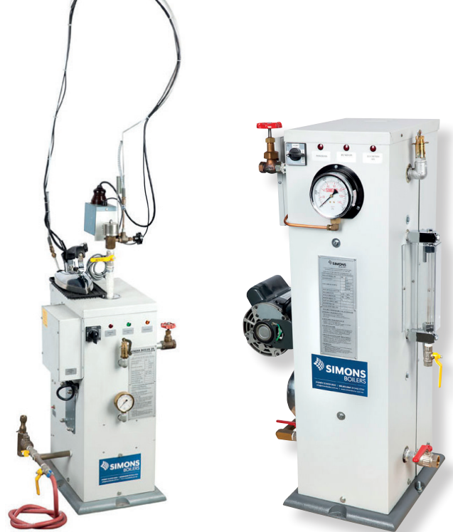
SB 2S SERIES 3.6 TO 10 KILOWATTS